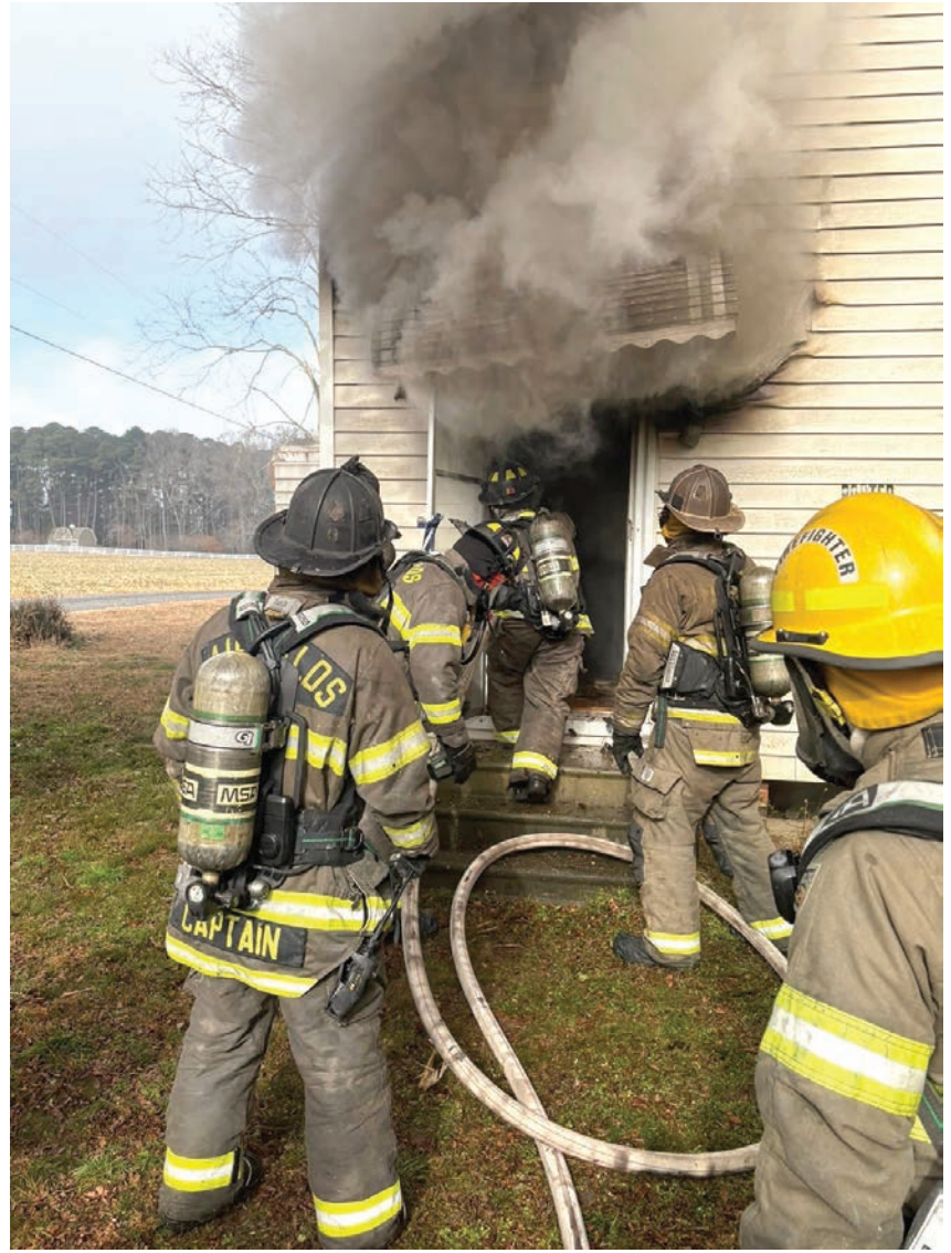
Fairfields Volunteer Fire Department members enter a burning house during a control burn.