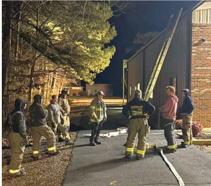
Fairfields Volunteer Fire Department volunteers conduct ladder and hose stretching drills.

Keyser said it's an ideal training facility for new members not yet comfortable with entering a burning building. "If something isn't right, the egress is right there so you have an easy way to get out."