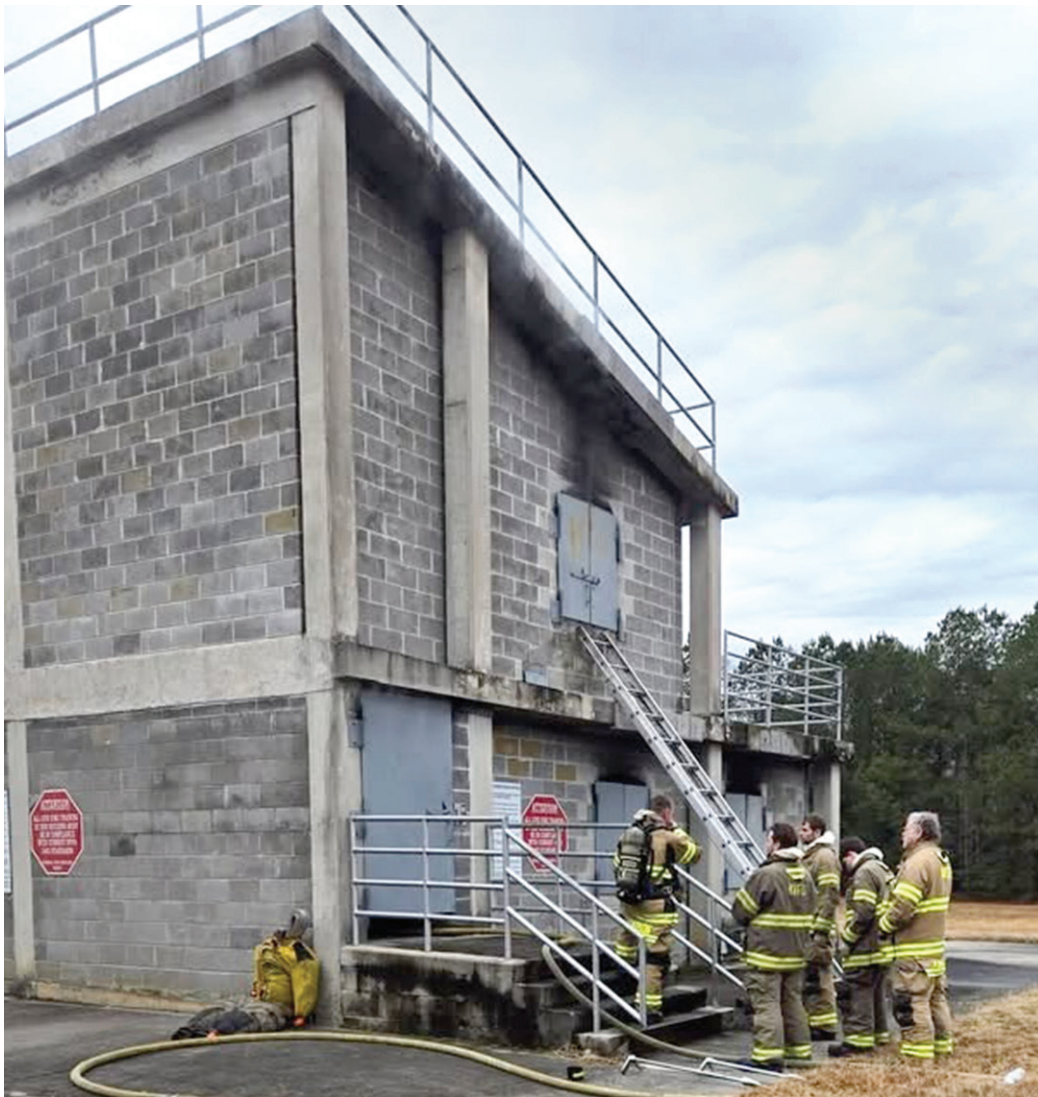
The burn building in Browns Store serves as a regional training facility for volunteers in Northumberland, Lancaster, Richmond, Westmoreland and Essex counties.

Life EVAC held a classroom training with WSVFD last year and a few years ago career firefighters from Fredericksburg offered a tips and tricks class in Northumberland County.