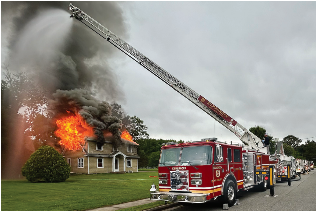
Volunteer fire departments from Kilmarnock, White Stone and Upper Lancaster took part in a control burn exercise in Weems.