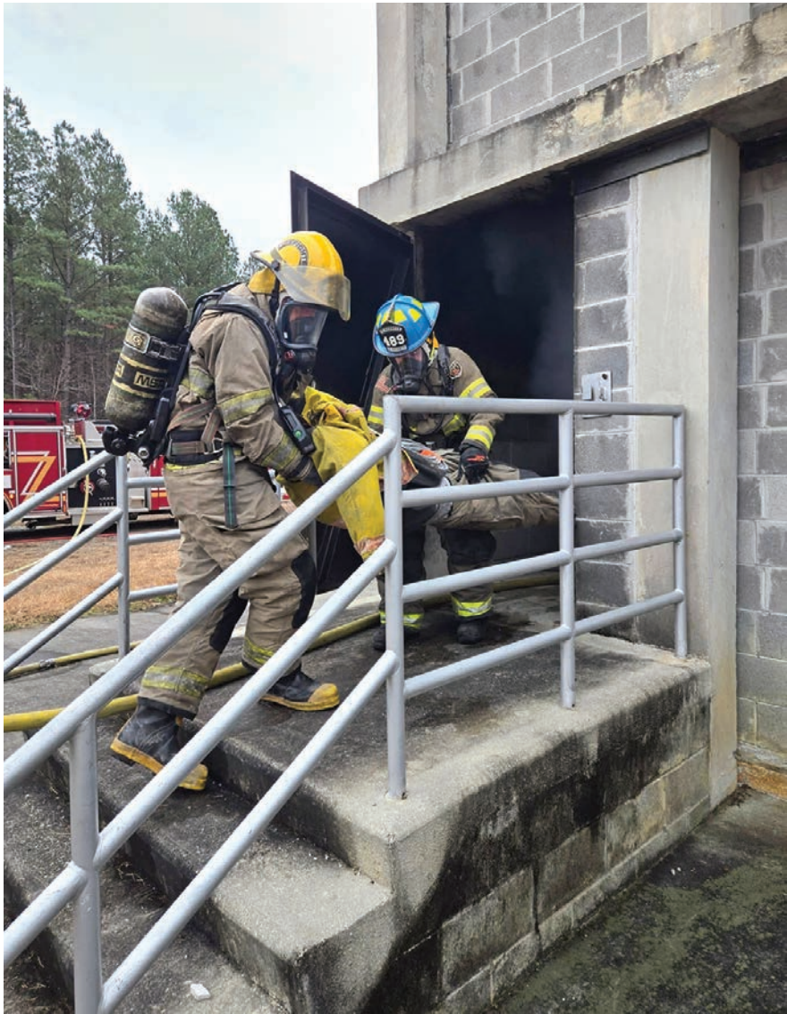
Firefighters practice removing victims at the regional burn building in Browns Store.