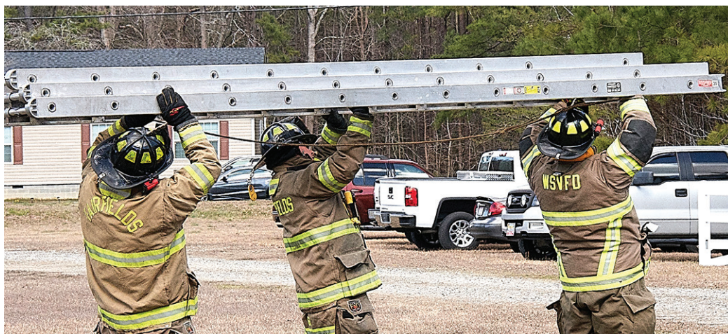
White Stone and Fairfield volunteer firemen practice ladder work.