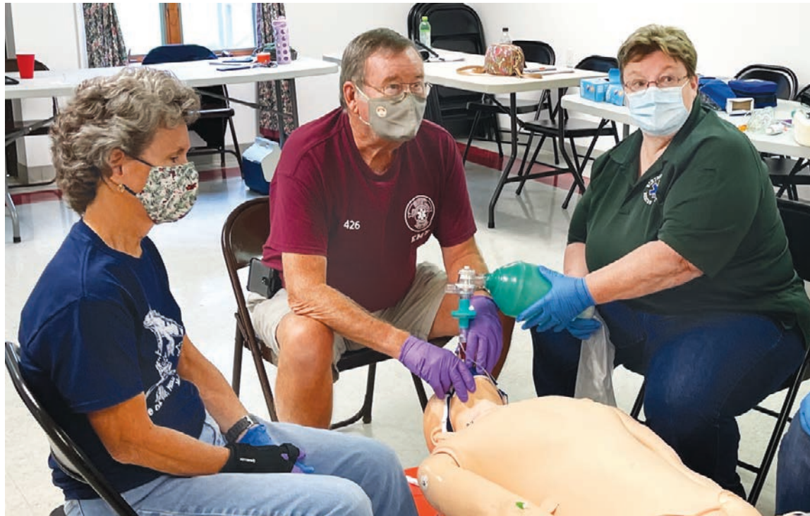
Middlesex County Volunteer Rescue Squad (MCVRS) members practice life-saving skills. The person at the head is “bagging” the patient — providing ventilation — the others are receiving instructions on what the patient’s vital signs are. They are looking at the LIFEPAK monitor to see if the interventions, like ventilation, are working so they can plan the next step. The role of BLS (basic life support) is to stabilize the patient and transport to a higher level of care or call for a higher level— Advanced Life Support.

recently retired. It gives them a purpose that could be missing since they retired. “It’s been found that if you are engaged with people or have a hobby, you are healthier . . . it extends your good years. We are a family. We are always laughing. It keeps you young.”