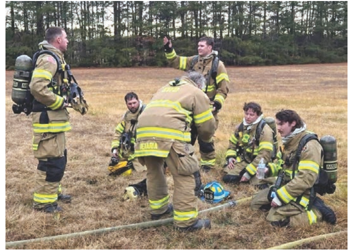
Kilmarnock volunteer firemen review following an exercise at the burn building.