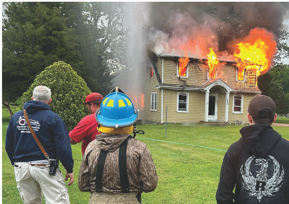
Firefighters watered down a neighboring home, trees, bushes and storage buildings, while monitoring a burning home during a training exercise in Weems.

lized by departments from Northumberland, Lancaster, Westmoreland, Essex and Richmond counties. It offers departments opportunities to train for real-life situations in a safe environment. The surrounding property also often serves as a medical emergency helicopter landing zone.